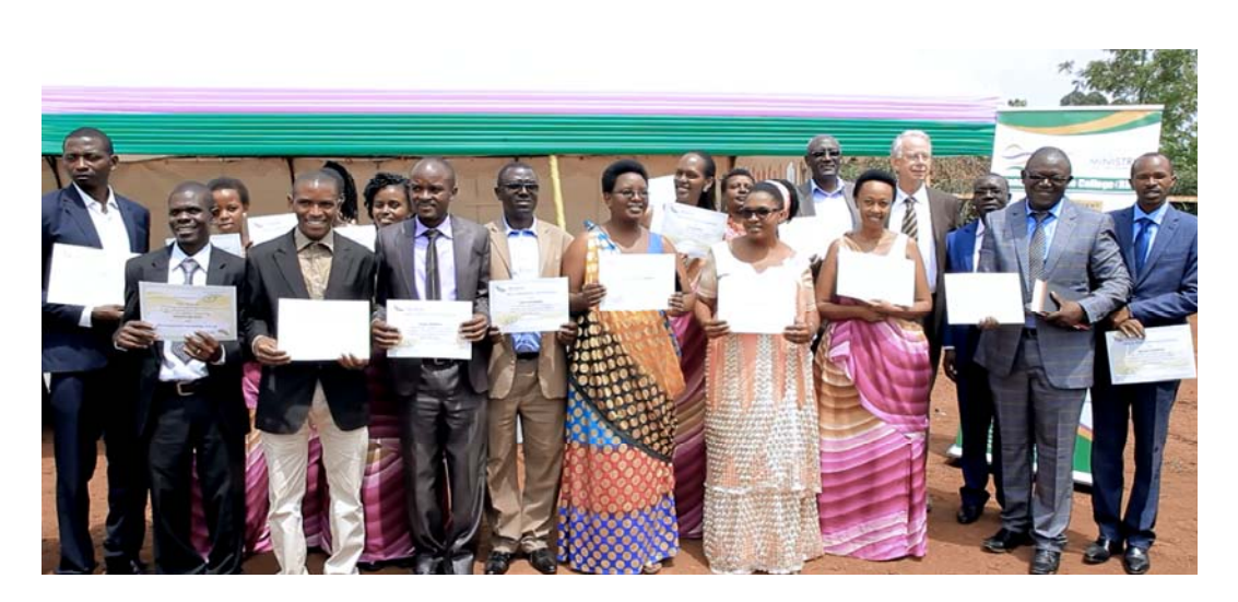
Everyone who has worked in our Kigali office over the past 10 years was honored with a certificate and thanked for their contribution.